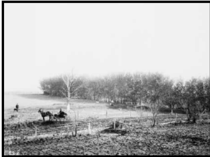
Fields at Far West, Missouri, where the Saints hoped to build their Zion.