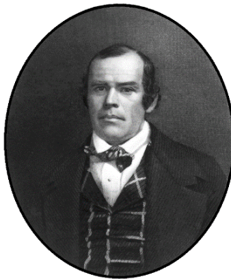
Parley P. Pratt