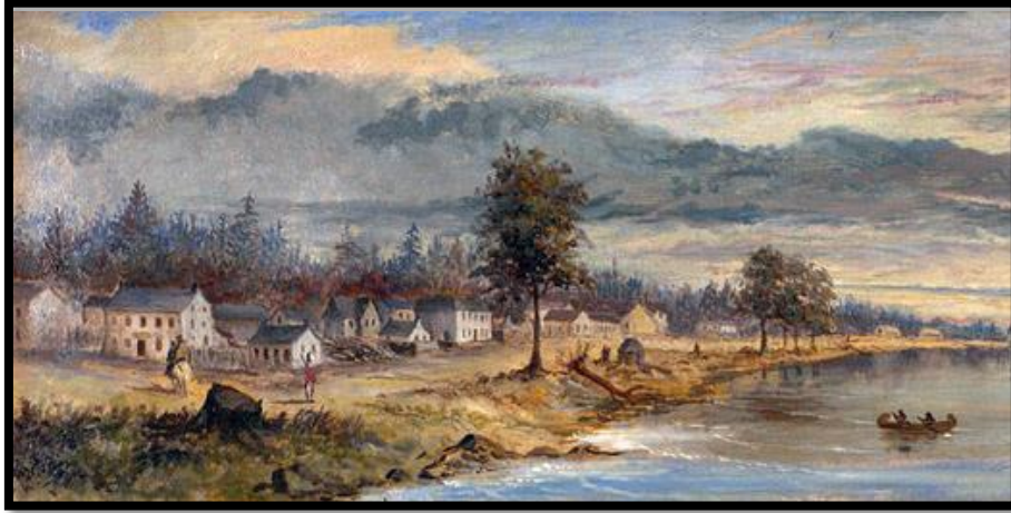
Along the shore of Lake Ontario in the early 1800s.