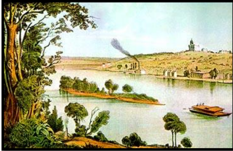
Nauvoo, Illinois, was so prosperous in the 1840s it was rivaled only by Chicago.

Although Nauvoo began as a rough settlement surrounded by malarial swamps, it soon grew into a bustling city worthy of its name, a Hebrew word meaning “beautiful place.” It didn’t take long for the Saints to replace their rough log cabins with beautiful frame and brick homes, most of them built on lots big enough to support a large kitchen garden and several fruit trees which blossomed in the spring. Soon Nauvoo’s wide, straight streets were lined with bakeries, tailor shops, blacksmith shops, sawmills, flour mills, several brickyards, a lime kiln, a printing office and several small factories. Attractive public buildings were also added, including the Masonic Hall, often used for concerts, plays and other social gatherings, and the Seventies Hall where missionaries met and were trained.