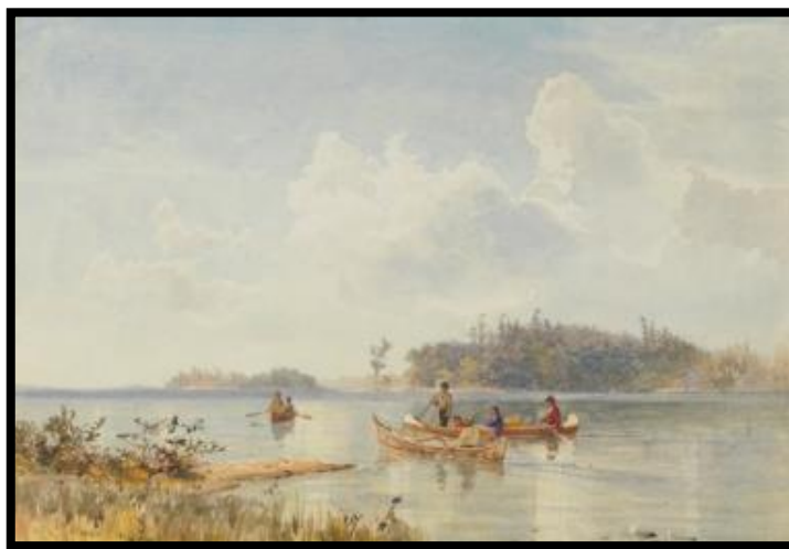
The country outside of Toronto was little more than untamed wilderness in the 1830s.