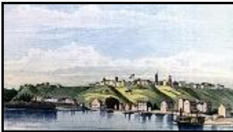
Quincy, Illinois, as it looked from across the Mississippi River in the late 1830s.