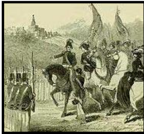
The Nauvoo Legion on parade.