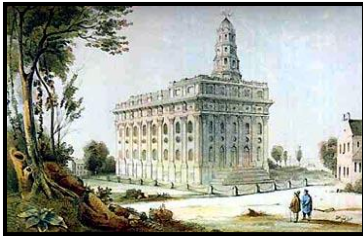
The Nauvoo temple was finished even as the Saints were fleeing the city.