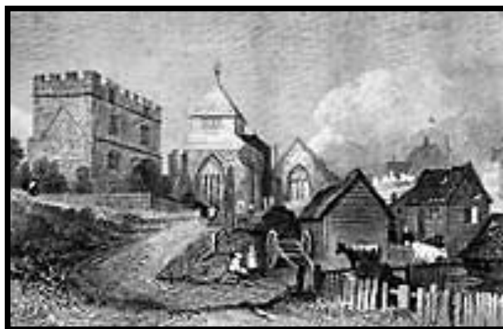
Minster, Isle of Sheppey, Kent, in 1830.