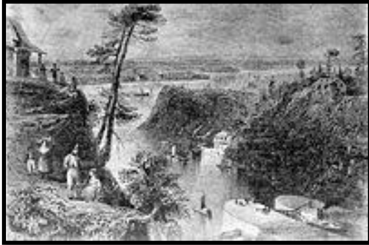
The Rideau Canal near Kingston, Ontario.