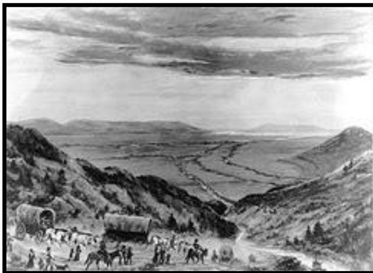
A wagon train entering the Salt Lake Valley.