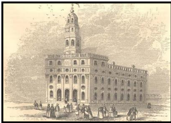
The Nauvoo temple at its completion in 1846.